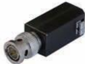
DS-1H18 Video Balun